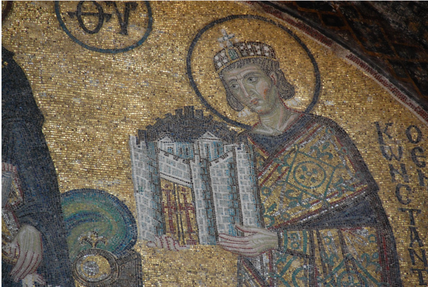
Figure 3. Emperor Constantine's donation of the city of Constantinople to the Virgin Mary (from the Hagia Sophia). Note the enormous visual prominence assigned to stylized city walls.

with God, Christ and the Virgin Mary as well as the city walls, was one of the most distinctive traits of Constantinople's spiritual and social identity.