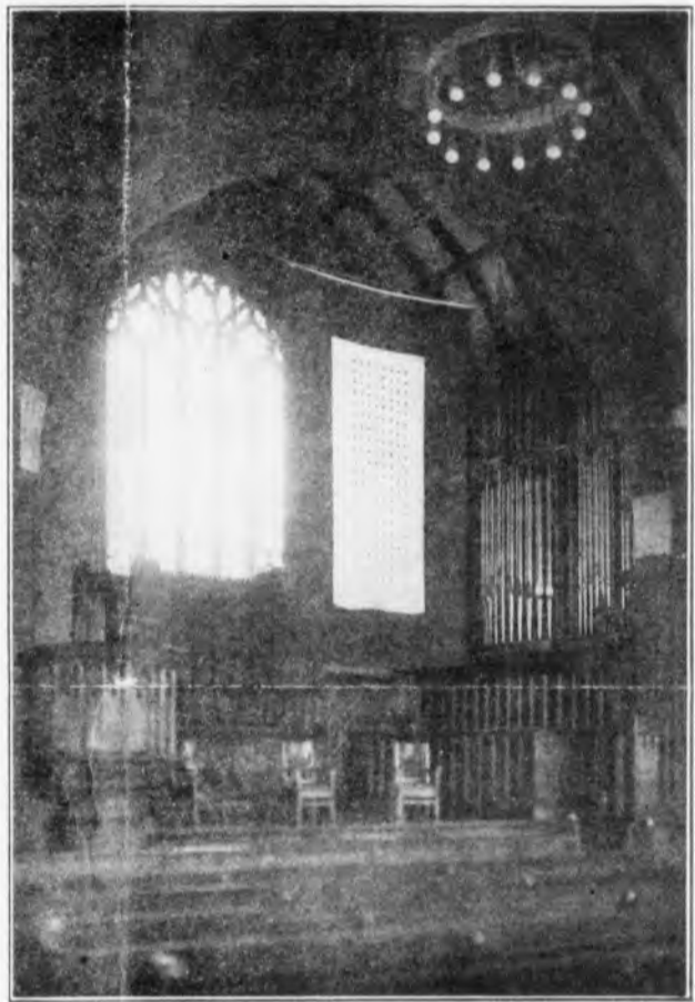
THE BATES SERVICE FLAG The Bates Service Flag hung over the Chapel platform originally had 126 stars and now boasts of 230 in the constella-

tion with none being added every day. This emblem of the "bit" that Bates has contributed so far is the most striking decoration in the Chapel.