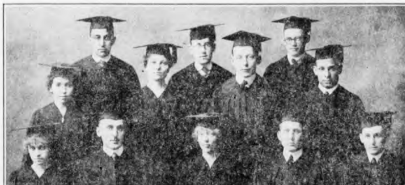
CLASS DAY SPEAKERS