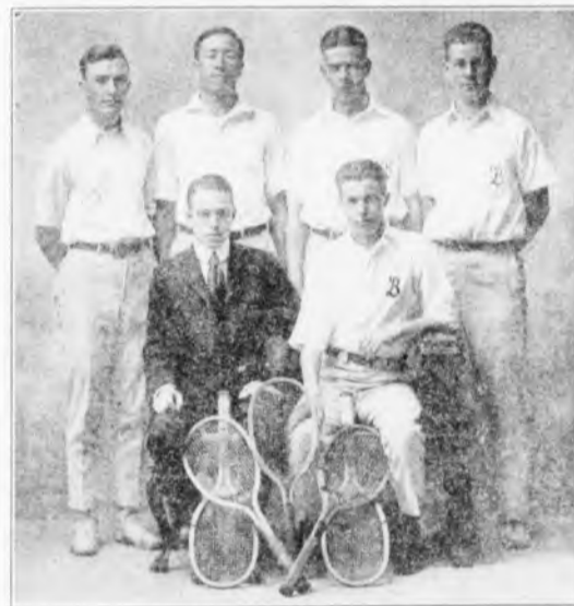
CHAMPIONS OF MAINE

For further information, apply to THE SECRETARY, 16 Huntington Avenue, Boston, Mass.