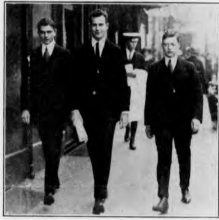
First International Debaters.

CRONIN & ROOT'S Everything to please the College Chap LEWISTON, MAINE