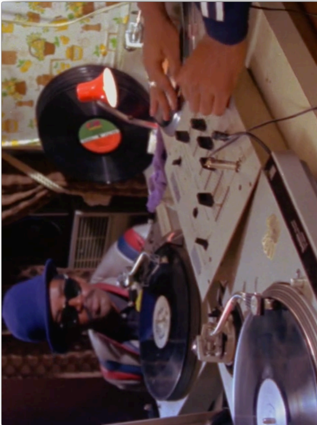
Figure 5. This is a better look at Grand Master Flash's set up in his kitchen. In the middle of his two turntables, he has several controls that affect the pitch, speed and volume of each turntable. His left hand is on the cross fader, which changes the master volume to either turntable. Wild Style . Dir. Charlie Ahearn. Submarine Deluxe, 2013. DVD.