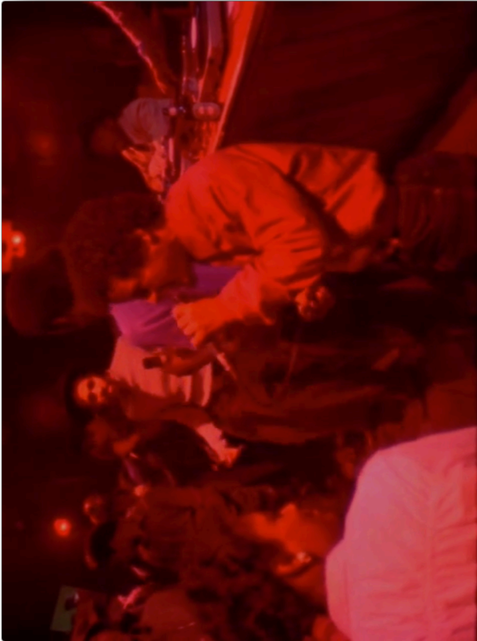
Figure 3. This is another shot from inside the club in the film Wild Style . At the far right of the picture, you can see the DJ's turntables right behind the emcees. Wild Style . Dir. Charlie Ahearn. Submarine Deluxe, 2013. DVD.