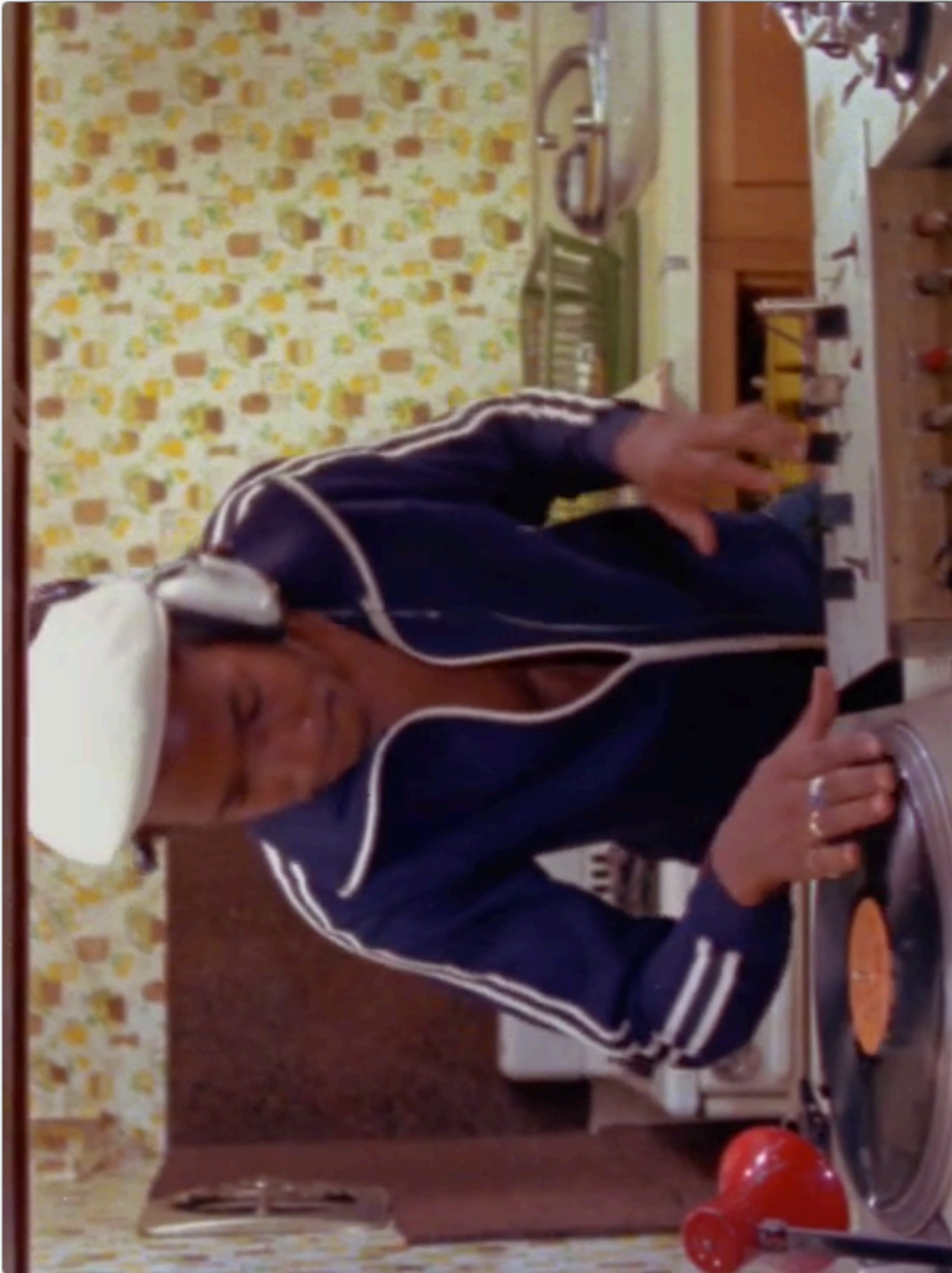
Figure 4. This is Grand Master Flash in the film Wild Style . He is in his kitchen scratching some records together for another character in the film. You can see as he places his hand on the record to pull it backwards, creating the scratching sound on the record. Wild Style . Dir. Charlie Ahearn. Submarine Deluxe, 2013. DVD.