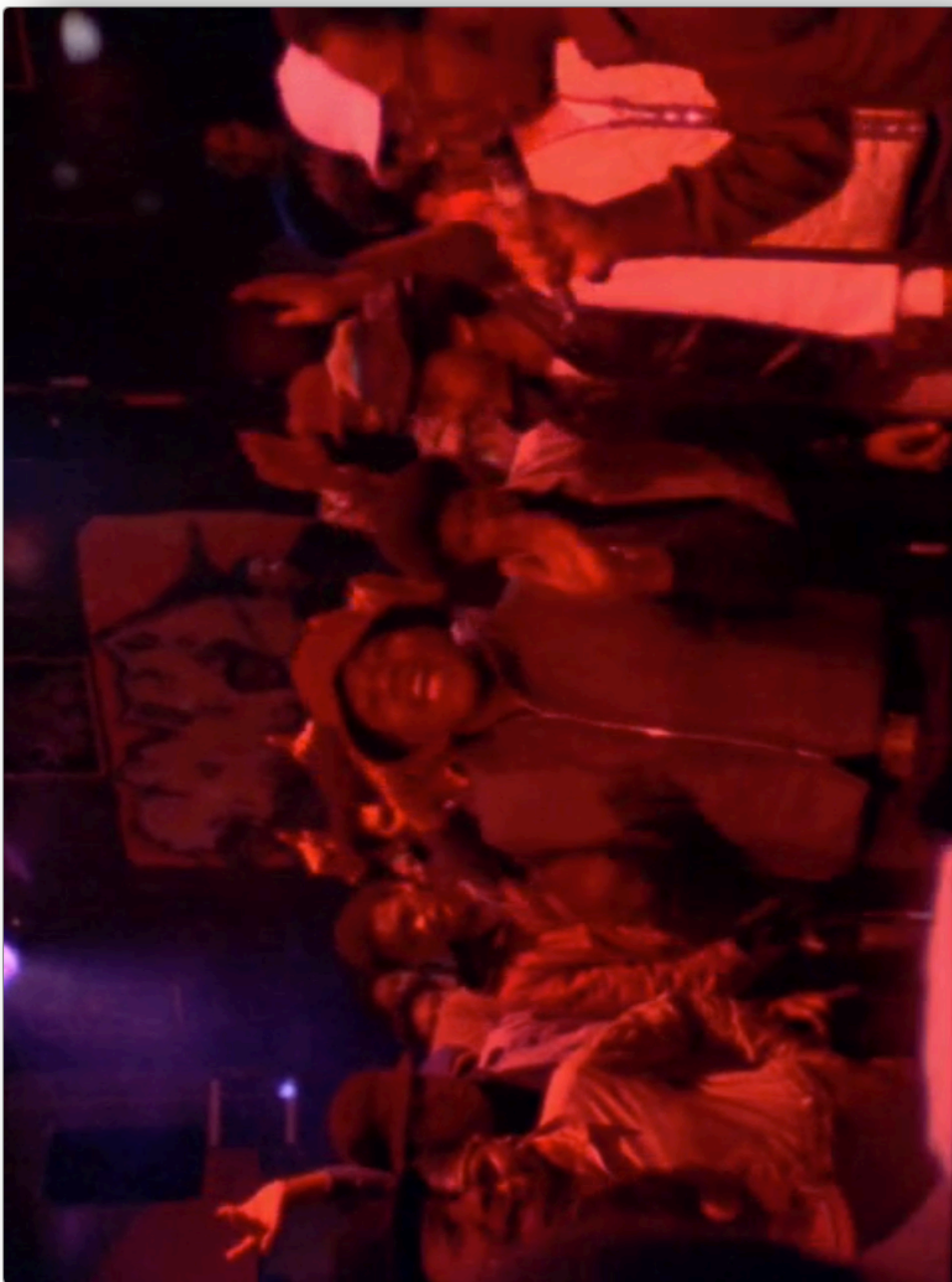
Figure 1. This is a scene from the movie Wild Style , made in 1983, where a local emcee (far right of the picture) is rapping in a small club. You can see just how close he gets to his audience. Wild Style . Dir. Charlie Ahearn. Submarine Deluxe, 2013. DVD.