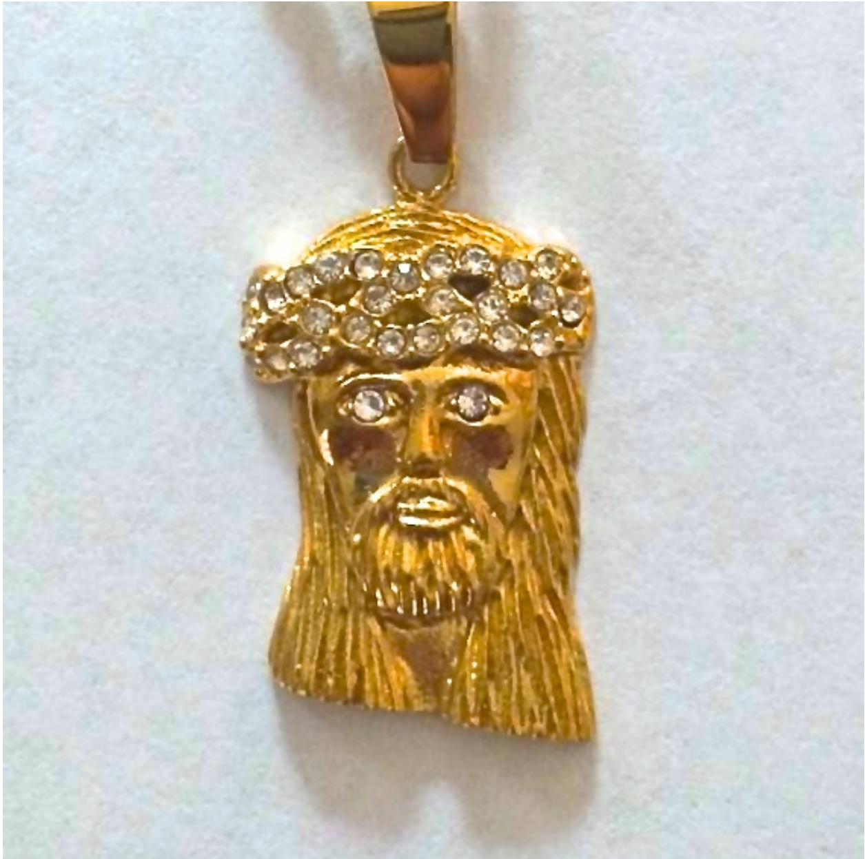
Figure 6. This is what a Jesus piece necklace looks like. Wale is rapping as if he is this necklace. "Jesus piece (jewelry)." Wikipedia, The Free Encyclopedia . Wikimedia Foundation, Inc., 29 October 2015. Web. 22 March 2016.