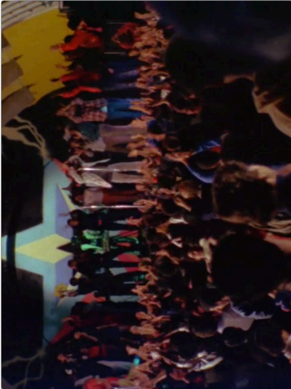
Figure 2. This is from the concert in the closing scenes of Wild Style . You can see that the emcees on stage are directing the crowd to clap and move their hands from side to side. Wild Style . Dir. Charlie Ahearn. Submarine Deluxe, 2013. DVD.