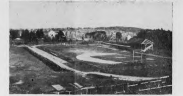
ATHLETIC FIELD FROM ROGER WILLIAMS FALL