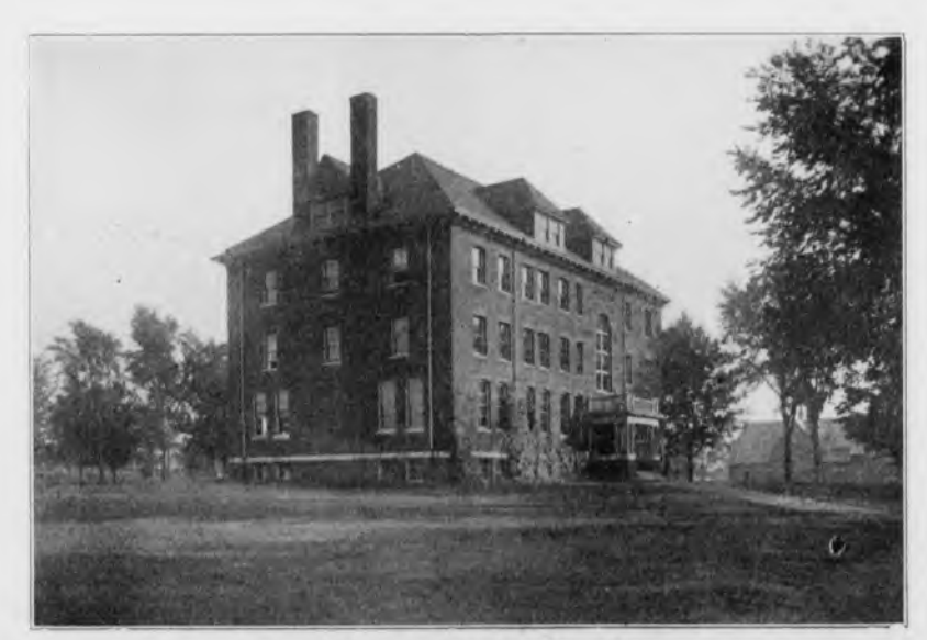
ROGER WILLIAMS HALL