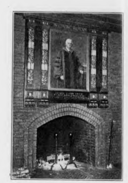
CHASE HALL MEMORIAL FIREPLACE