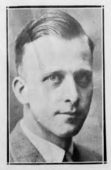
PRES. OF SENIOR CLASS