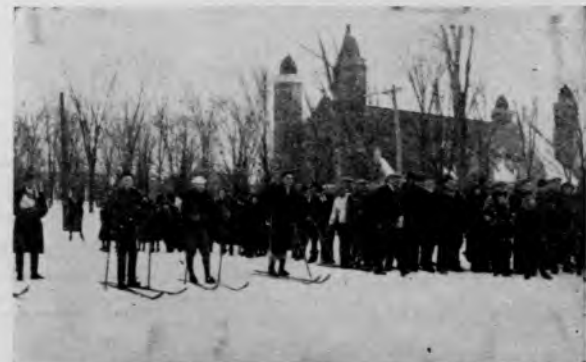
START OF CARNIVAL SKI-RACE