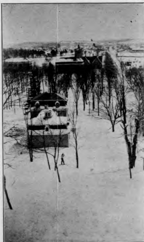
THE CAMPUS FROM MT. DAVID