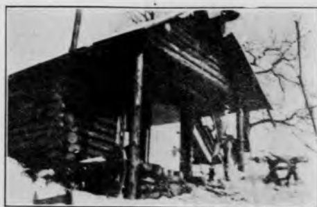
CABIN ON MT. SABATTUS