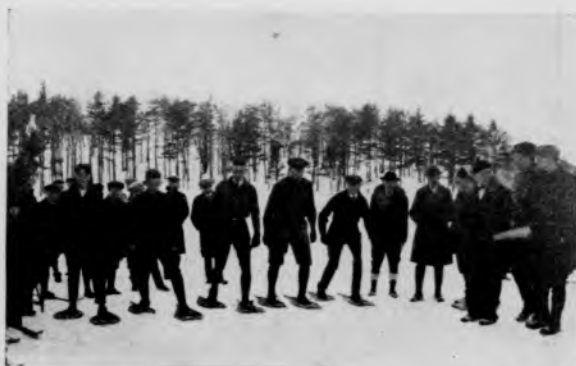
SNOWSHOERS AWAITING THE GUN