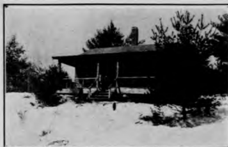
THORNCRAG CABIN (Stanton Lodge)