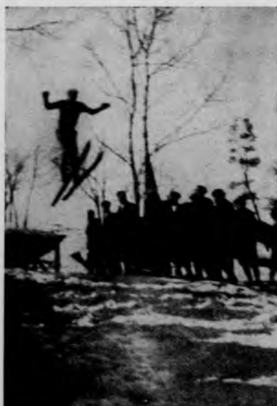
SKI-JUMPING ON MT. DAVID FROM ABOVE AND BELOW

Popular and active interest only is needed to make this tete-a-tete carnival idea a great success. The fun we get out of it will be in proportion to what we put in.