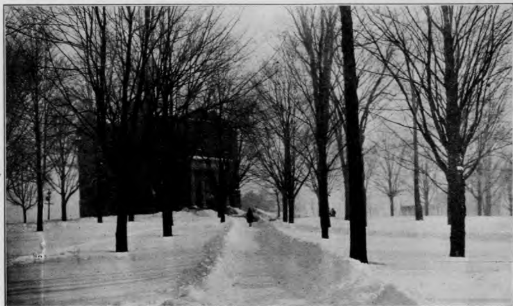
HATHORN AND CAMPUS IN WINTER