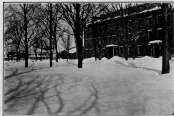
PARKER IN WINTER