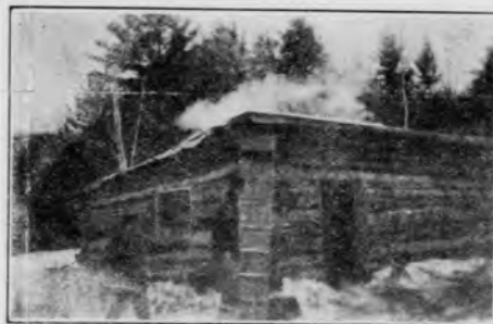
CABIN AT ALBANY, MAINE