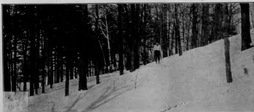
SKIING DOWN MT. DAVID