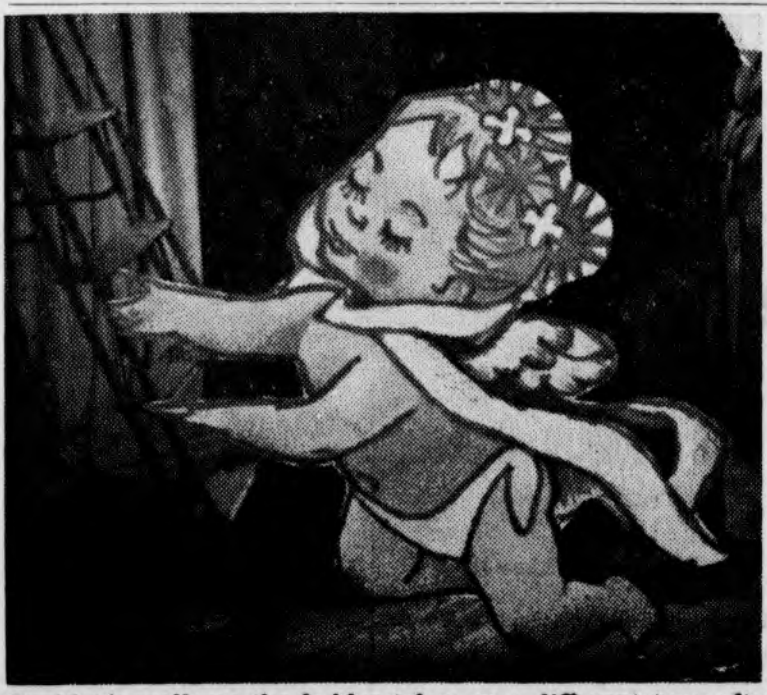
Cauldon's walk up the ladder takes on a different tone after his successful labotomy operation.

Cross, in reply, issued the fol-This is not an unusual play; lowing statement just before everyone goes through this. publication time: "No one ever them on the pathways, we shall render!"