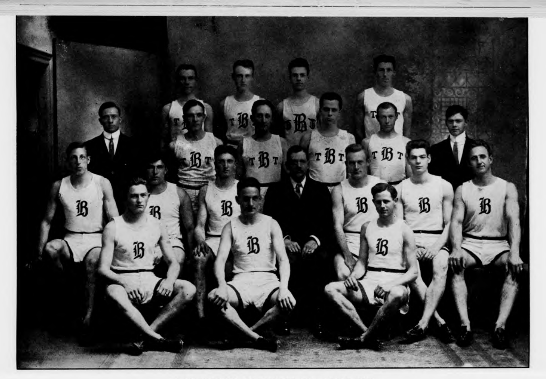
STATE CHAMPIONSHIP TRACK TEAM, 1912