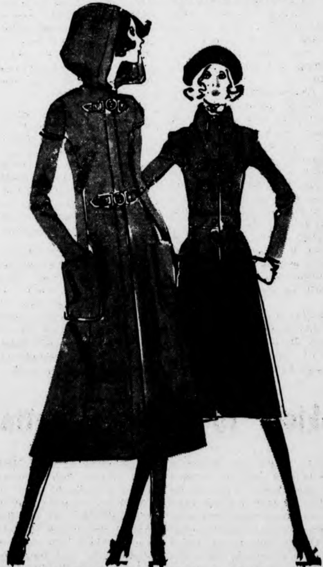
LEFT: Camel Coat With Hood And Toggle Hardware Closing . . . Sizes 5 to 13, $75

For The NEWEST Fashions . . . IT'S HERE AT WARD BROS.