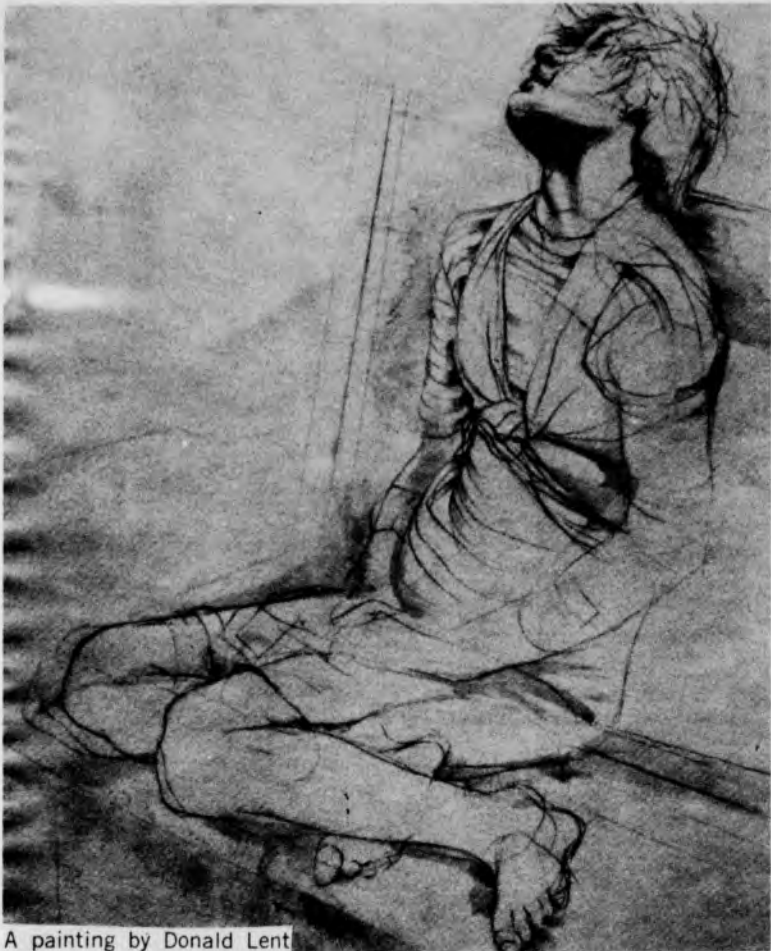
A painting by Donald Lent