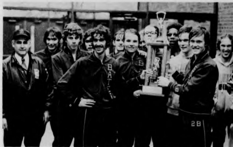
Bringing home the bacon.