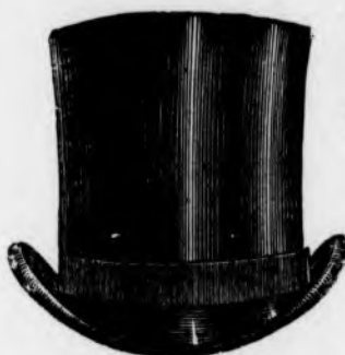
Sign, GOLD HAT,