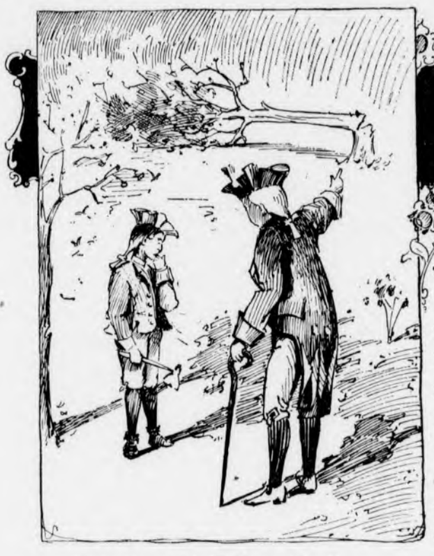
"3 Cannot Tell a Lie."

We tuned our lyre to sing of truth, But still no truthful song would rise. Alas! alas! 'tis easier far To write a multitude of lies.